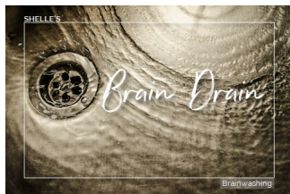
Brain Drain | Shelle Rivers